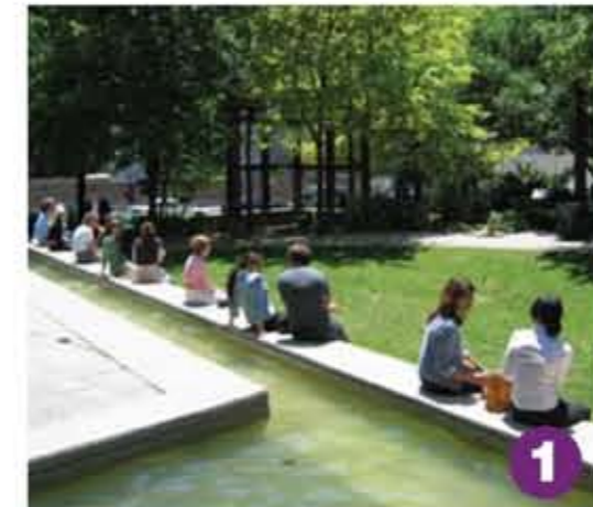
New park opportunities

Use the post-it notes or write directly onto the plan any concerns that you may have with the proposals. You can also identify any additional ideas you may have for making a Greener Centretown.