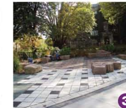
Open space opportunity tied to redevelopment

? Draw on the plan any other locations that you think might be a good place for a park.