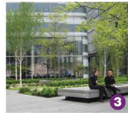
Open space opportunity tied to redevelopment