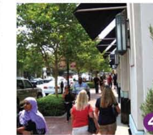
Streetscape improvement/Urban Forest