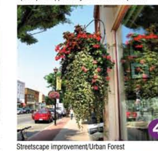
Streetscape improvement/Urban Forest