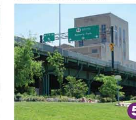
Re-imagining of 417 green space

? Are we missing any other streets that would benefit from tree planting? If we missed one, write its name on a post it note and stick it to the plan where the street is located.