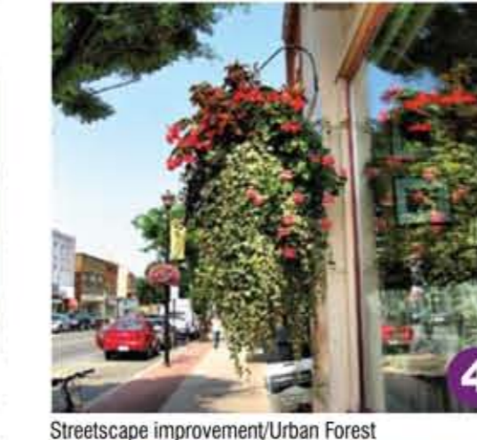
Streetscape improvement/Urban Forest