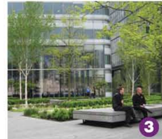
Open space opportunity tied to redevelopment