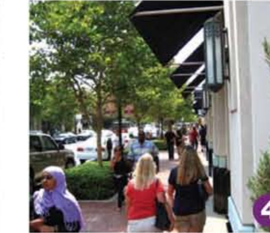
Streetscape improvement/Urban Forest