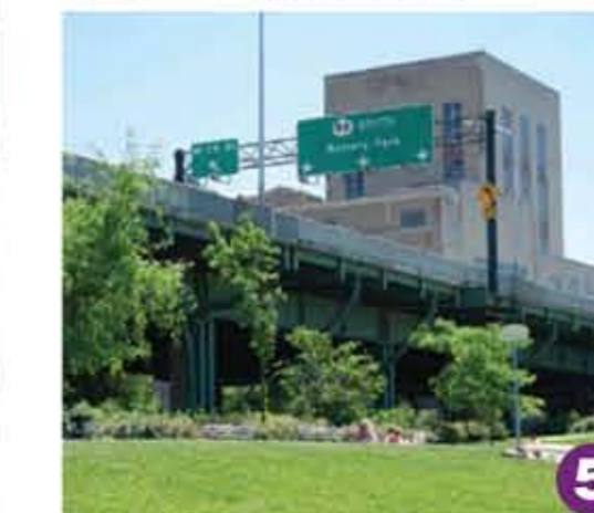
Re-imagining of 417 green space

? Are we missing any other streets that would benefit from tree planting? If we missed one, write its name on a post it note and stick it to the plan where the street is located.